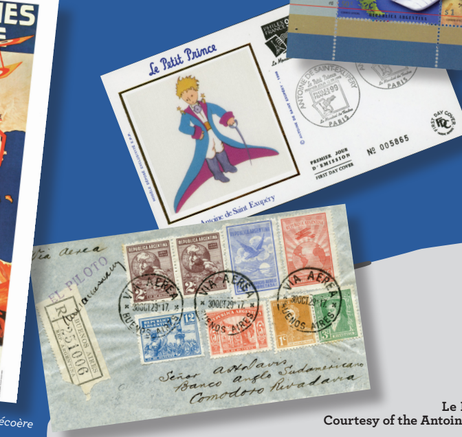
Le Petit Prince® - Property of LPP612 - Courtesy of the Antoine de Saint-Exupéry Youth Foundation