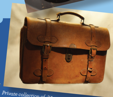
Private collection of d'Agay - Saint Exupéry Estate