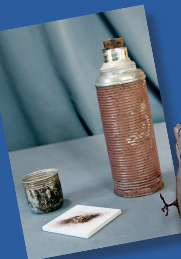
Collection of Mehun-sur-Yèvre Museum

Discover how the seminal tale came about and the unusual man behind its creation. Retrace his footsteps as a mail pilot on the roads less travelled. Meet unforgettable characters from The Little Prince and their real-life inspirations and relive iconic moments. On display are beautiful stamps and philatelic materials, personal belongings of the author, hand drawn illustrations, first edition books and magical sculptures by Arnaud Nazare-Aga.