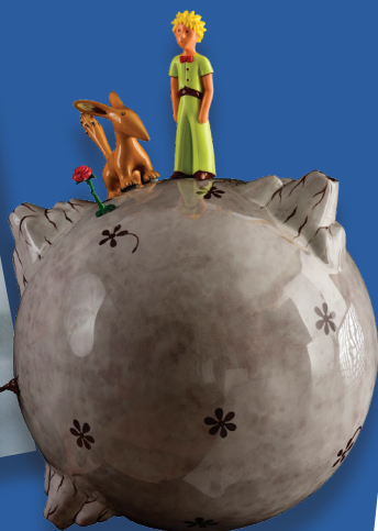
© Arnaud Nazare-Aga Photo credit: Roland Neveu